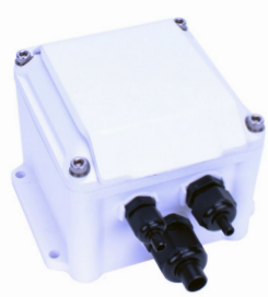
Optional Protective Cover Closed